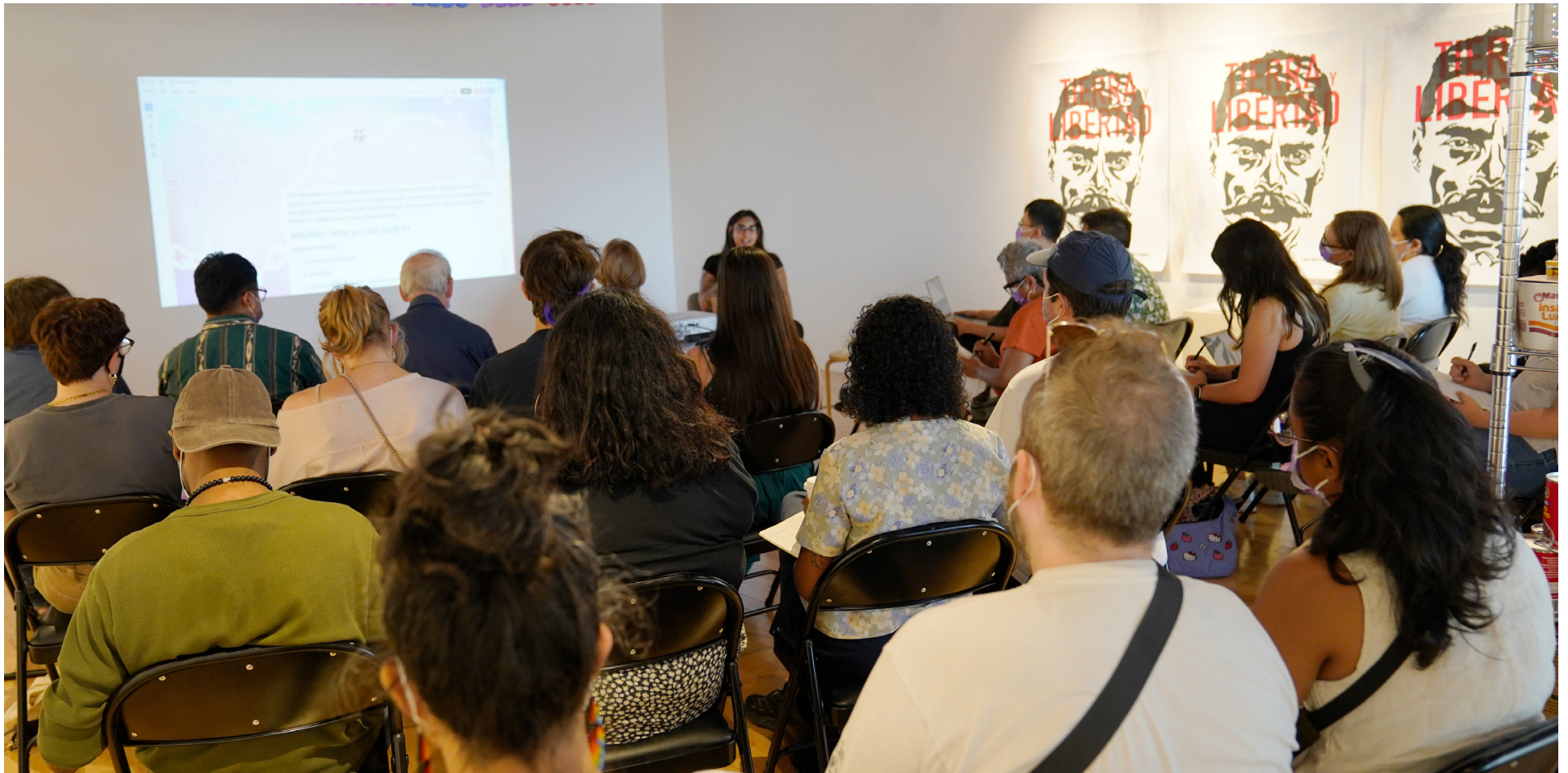
Working on It! Grant Writing Workshop, July 27, 2024, Cannon Gallery

year. These successes are a reflection of the Inc.'s supportive community. Without the folks that attend our openings, workshops and special projects, or apply to our exhibitions, there would be no Hamilton Artists Inc.. We are grateful to the support of our community and the collective ambition of Staff, Board, Chairs, Committee members and Volunteers for their distinct mark on another incredible year.