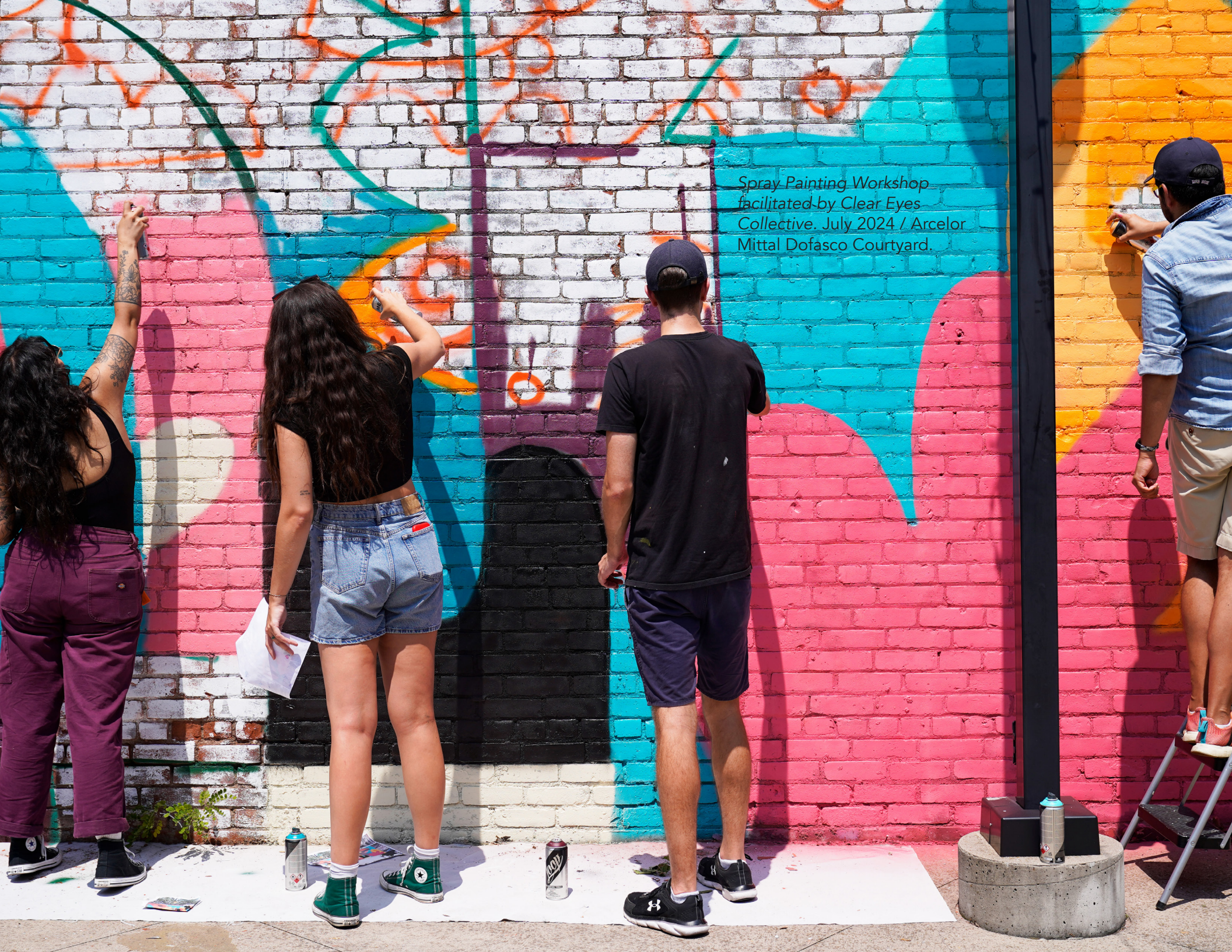
Spray Painting Workshop facilitated by Clear Eyes Collective. July 2024 / Arcelor Mittal Dofasco Courtyard.