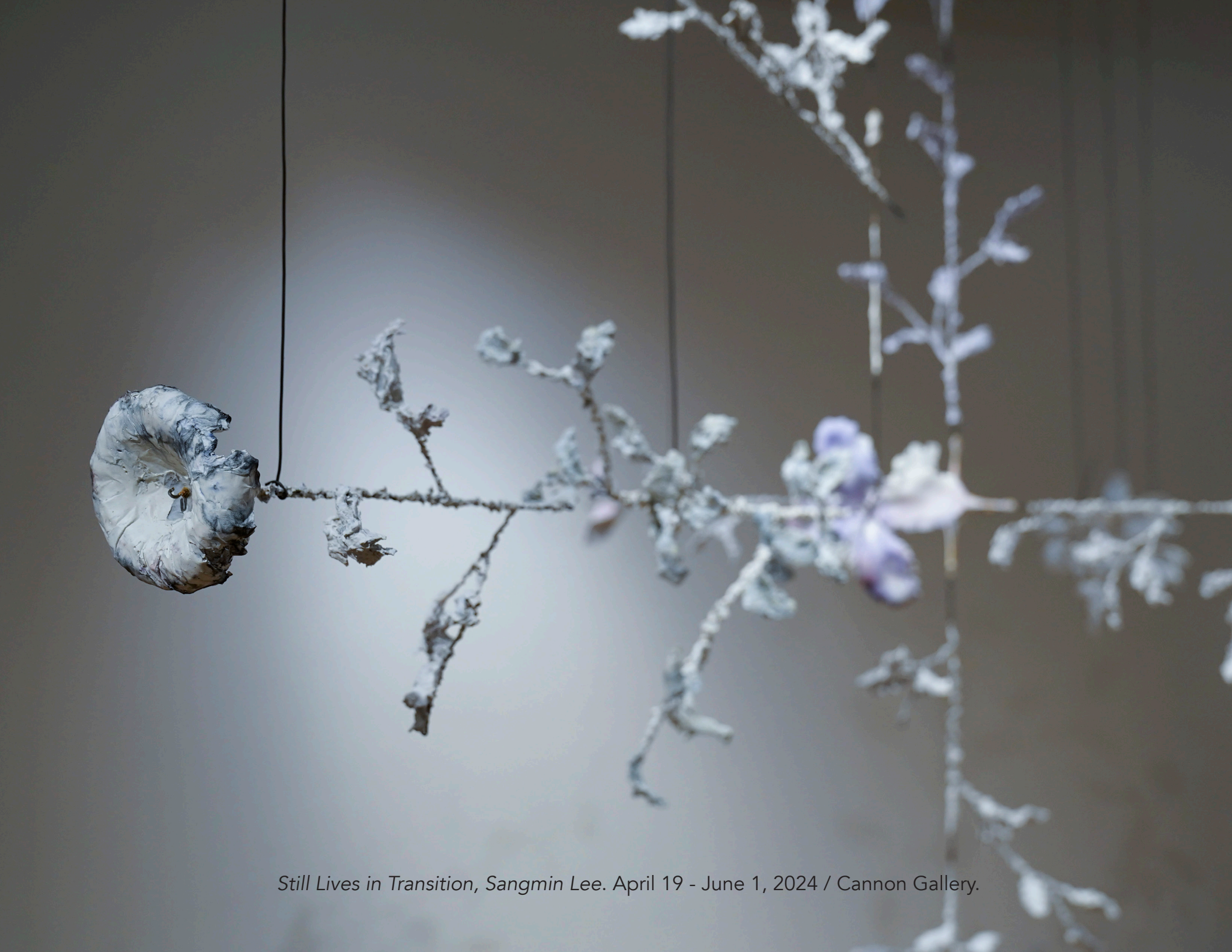
Still Lives in Transition, Sangmin Lee. April 19 - June 1, 2024 / Cannon Gallery.