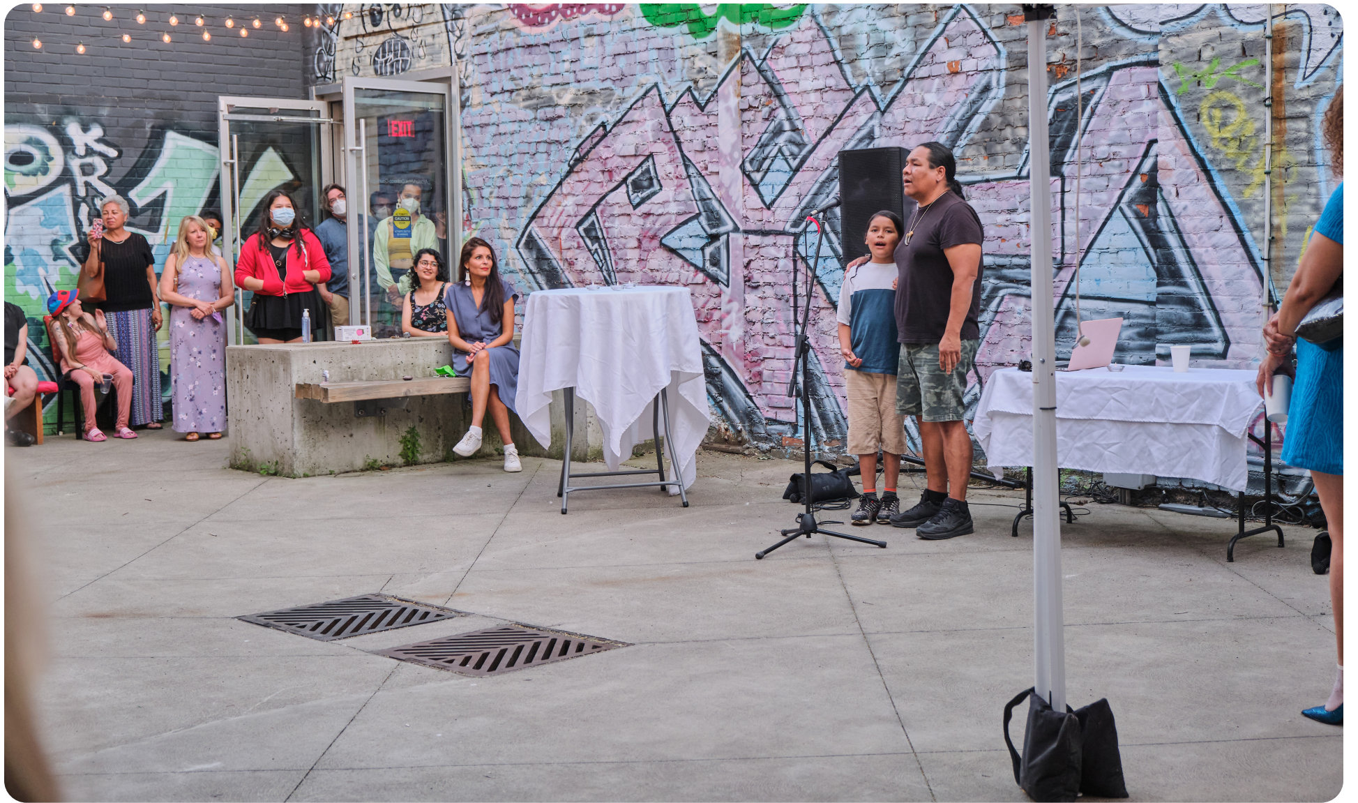
Born Celestial Performance