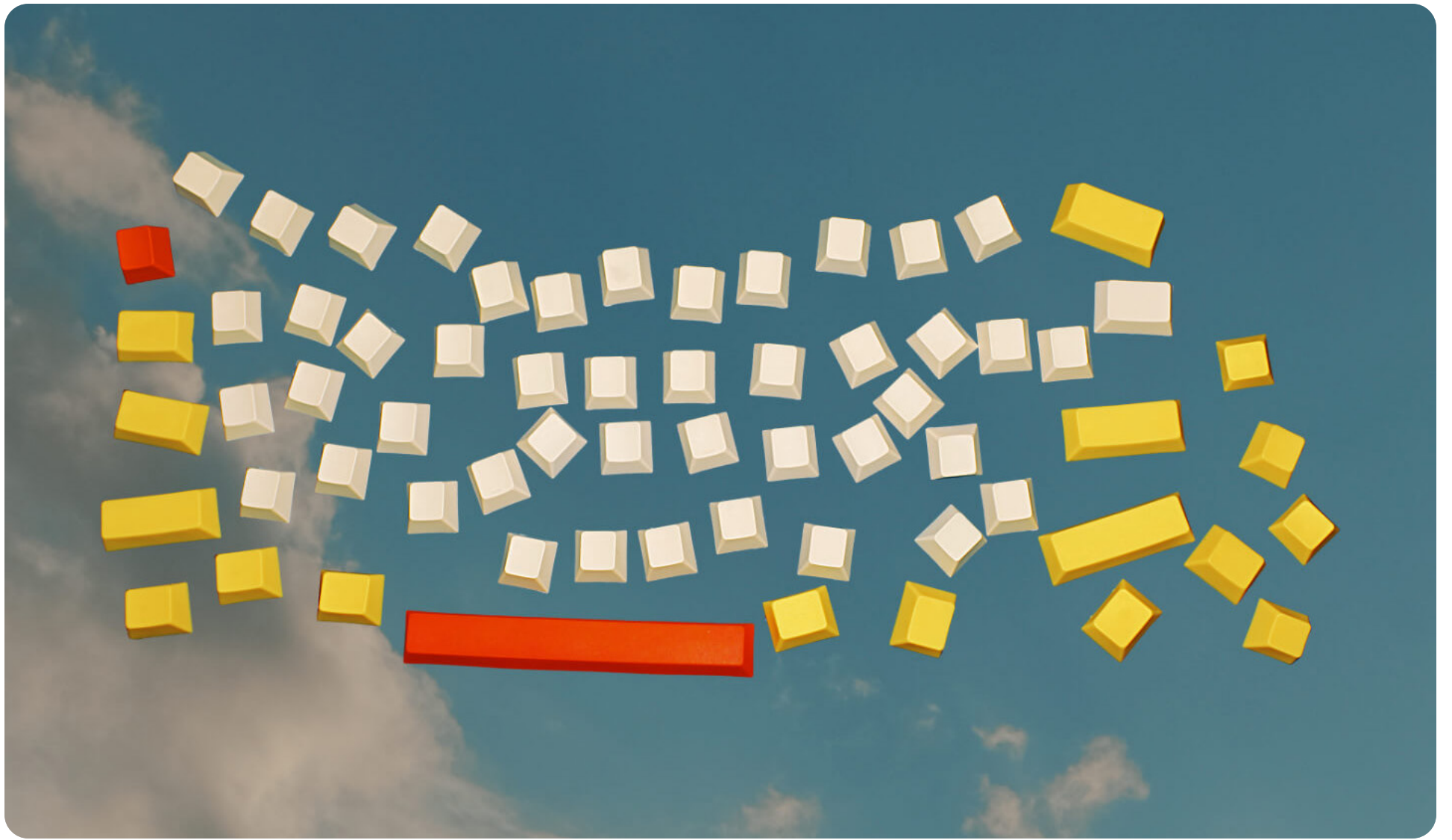
Nothing More to Say , Hanan Abbas. From Ignition 10 . February 4-March 12, 2022.