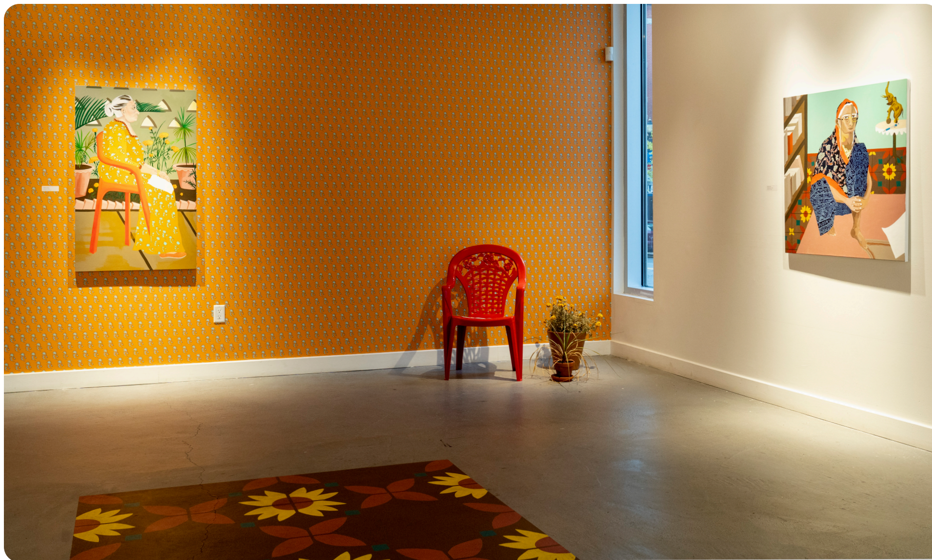
Who's Your Dadi? , Meera Sethi. August 27-October 29, 2022. Exhibition view.