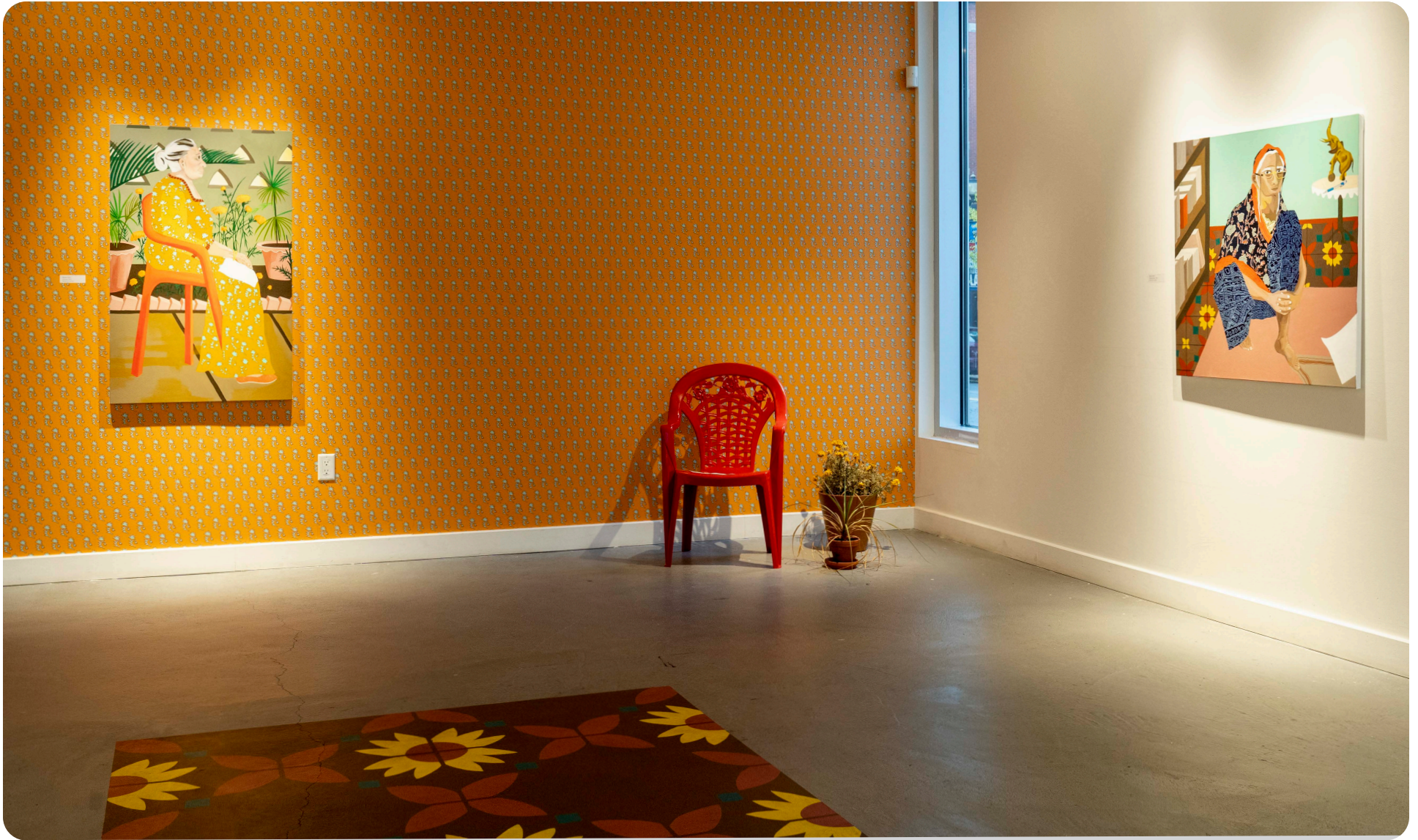
Who's Your Dadi? , Meera Sethi. August 27-October 29, 2022. Exhibition view.