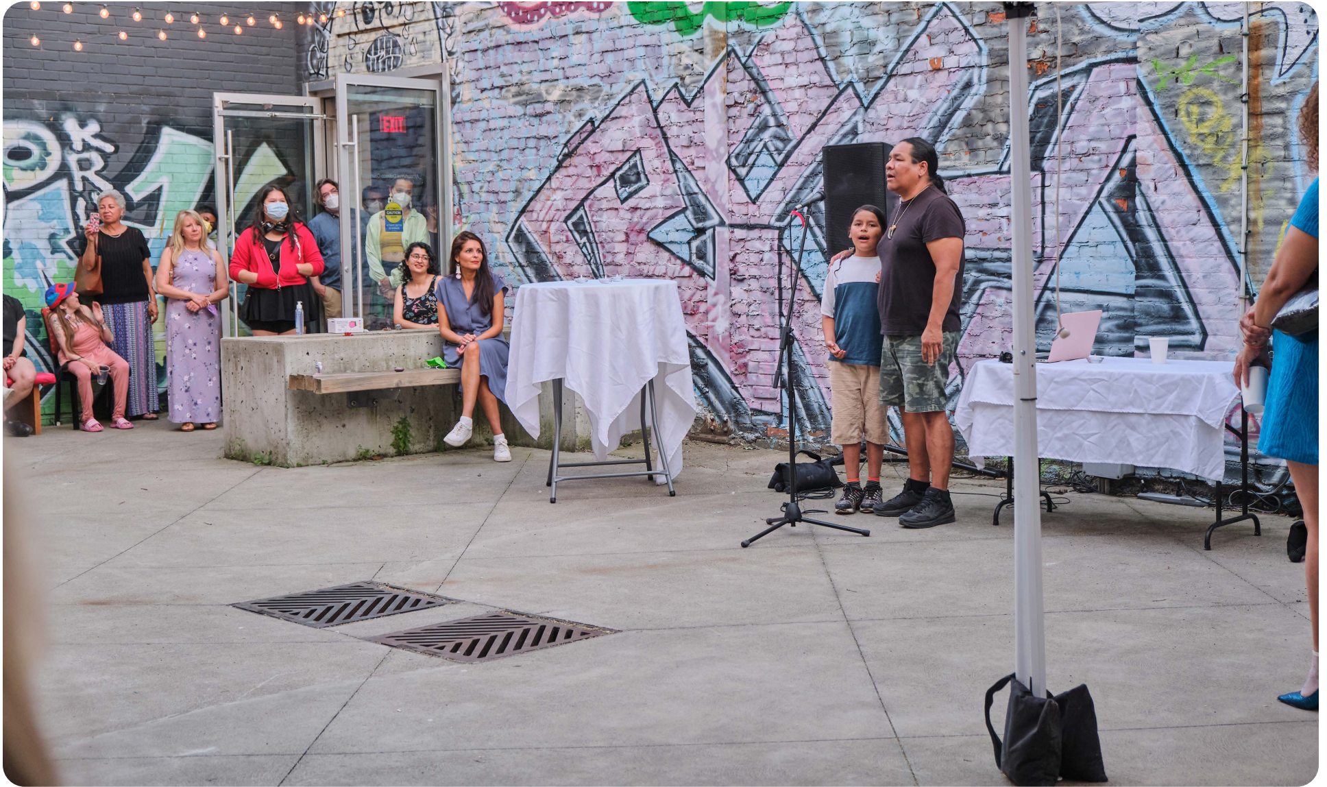
Born Celestial Performance