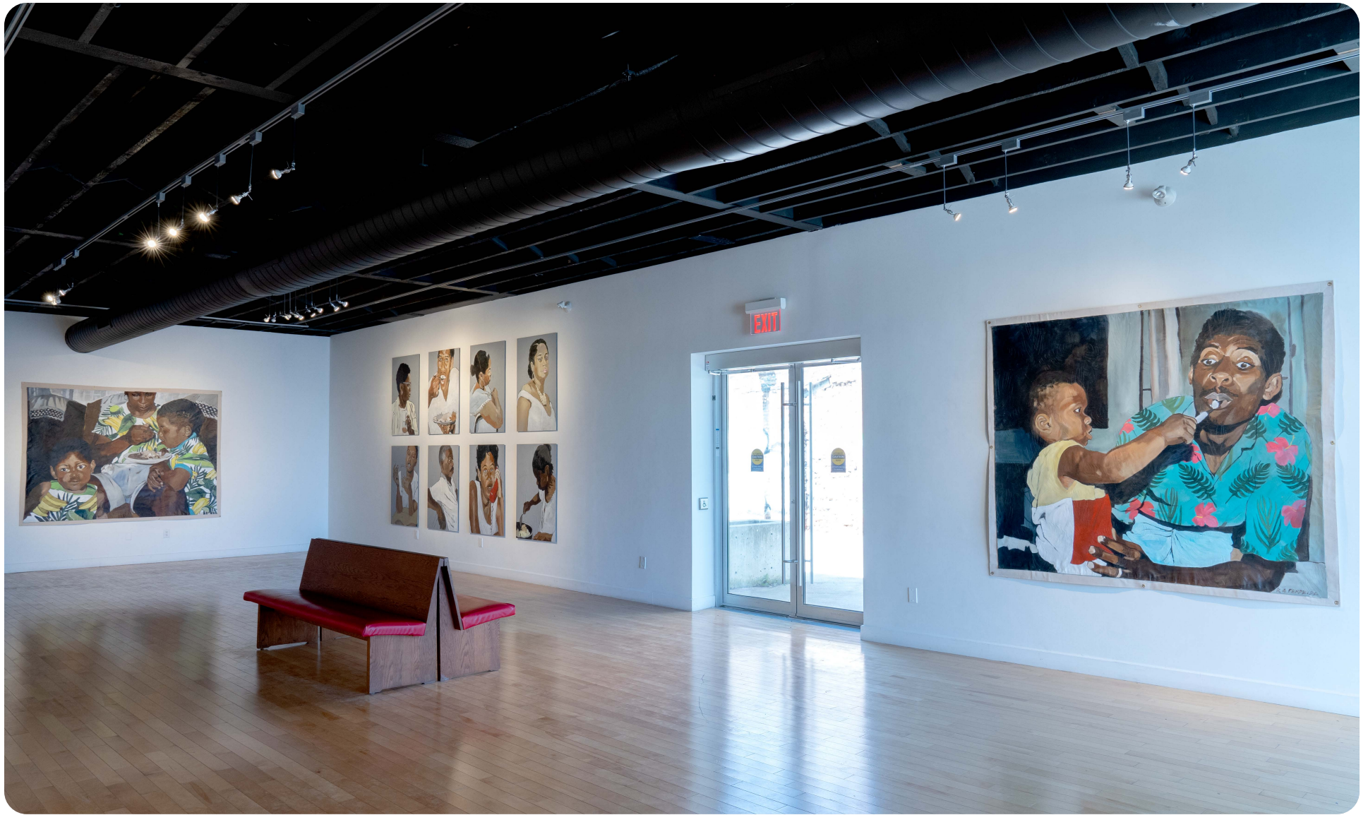
Table, Manors , Kareen-Anthony Ferreira. Exhibition view. March 26-May 14, 2022.