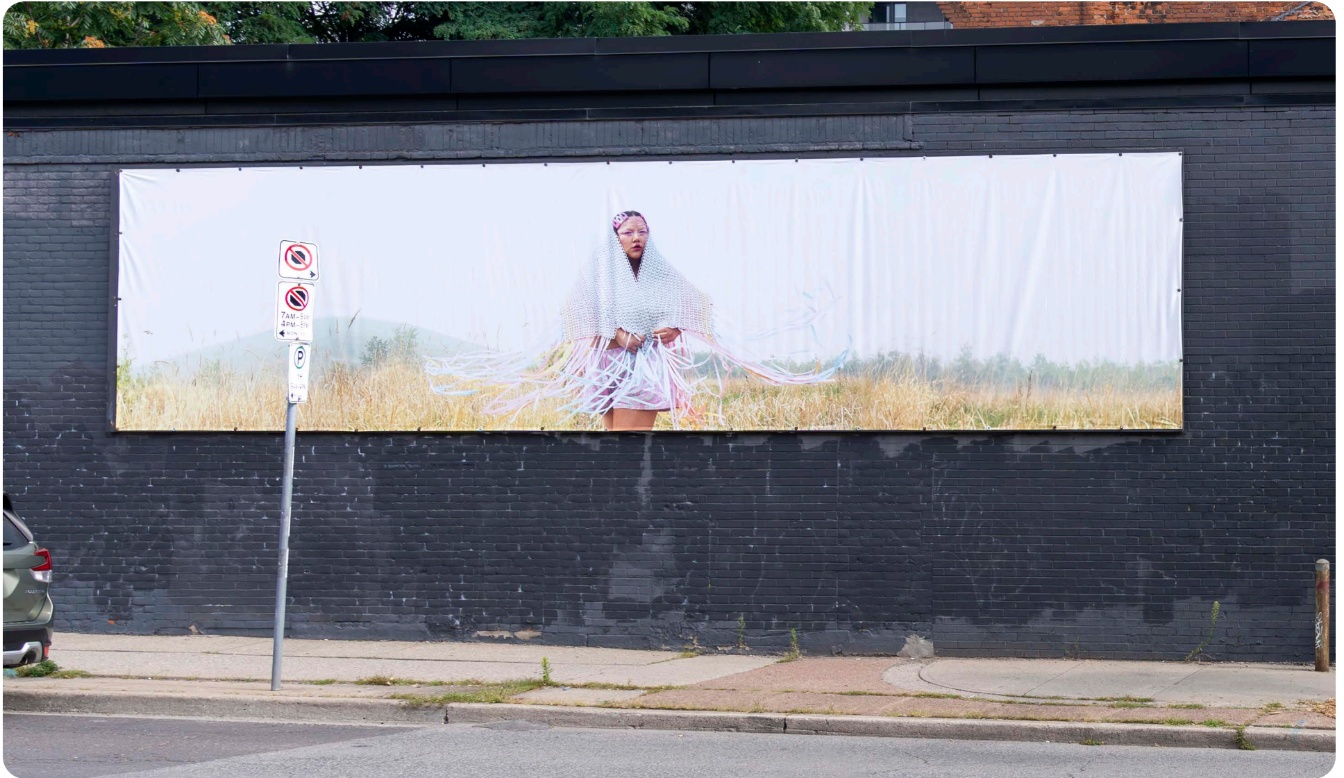
Nothing More to Say , Hanan Abbas. From Ignition 10 . February 4-March 12, 2022.