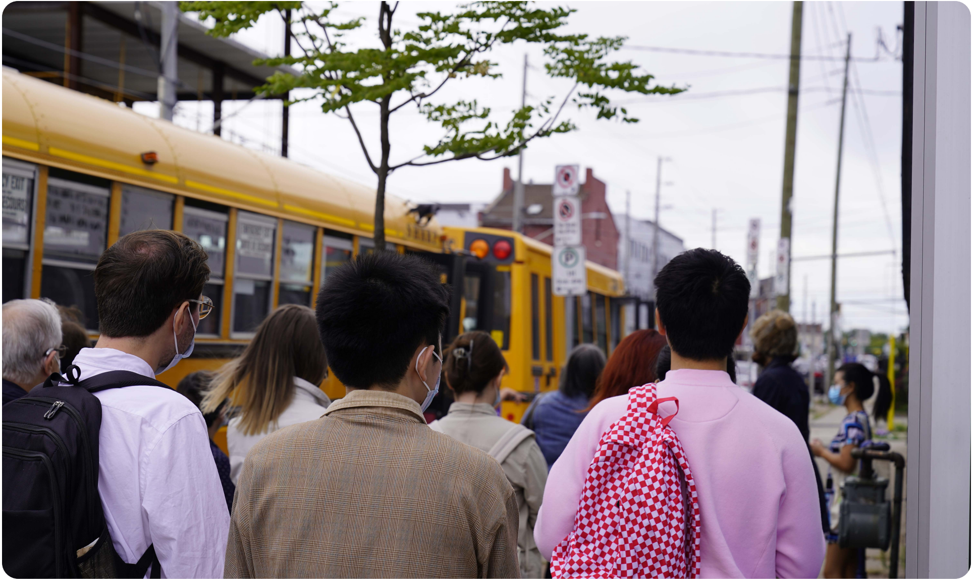
View of the Art Bus Tour. September 24, 2022.