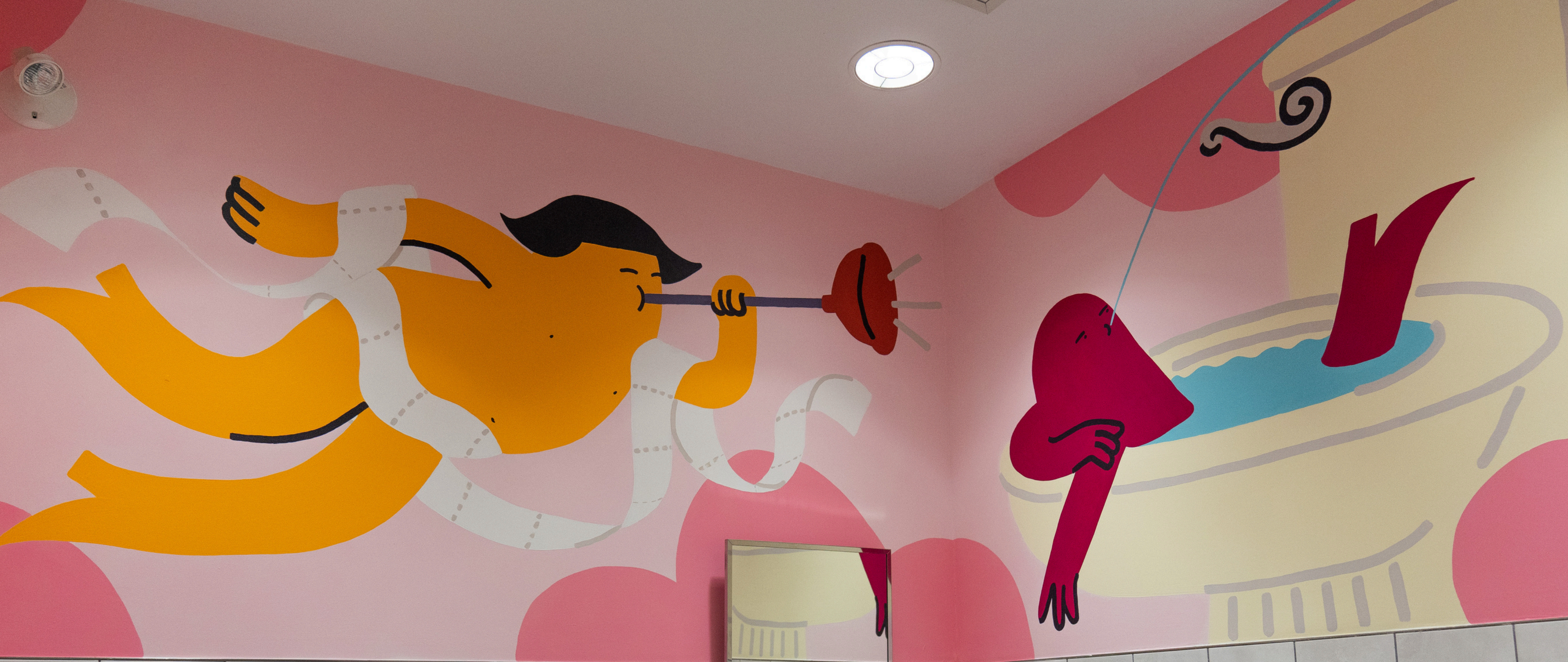
The Great Equalizer (I or II, curated by Sonali Menezes), Allison + Cam - Inc. Bathroom Murals. July 9, 2025 - June 1, 2026