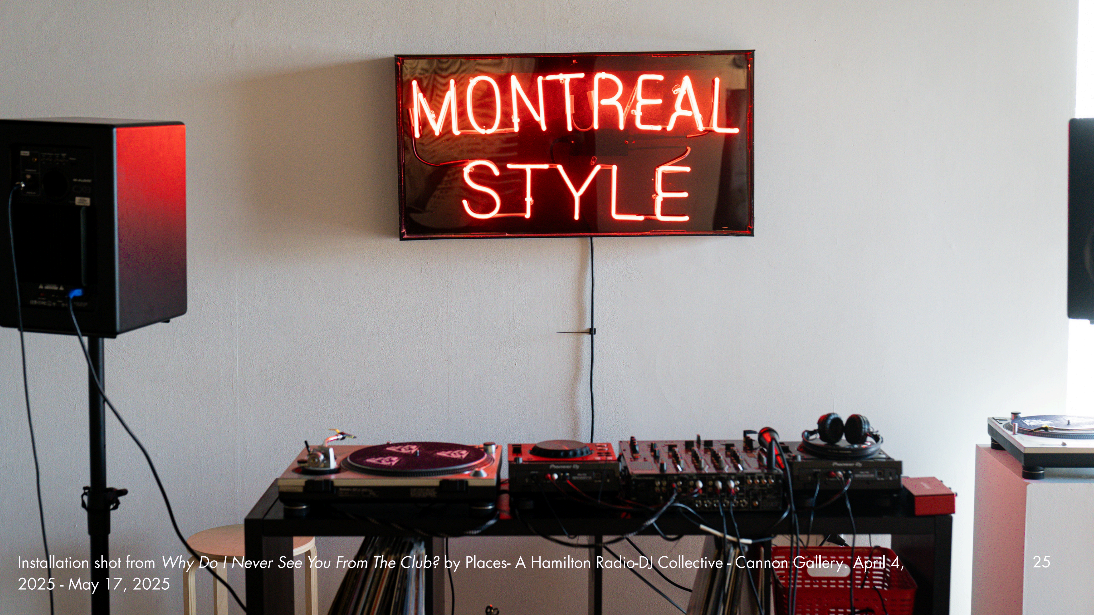
Installation shot from Why Do I Never See You From The Club? by Places- A Hamilton Radio-DJ Collective - Cannon Gallery. April 4, 2025 - May 17, 2025