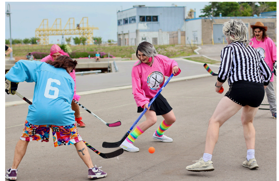
Photos from Drag Ball Hockey, Taken by Dom (@djspil_photography). Sept 13, 2025