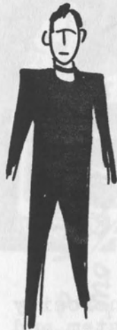
BROTHER (FRONT VIEW)