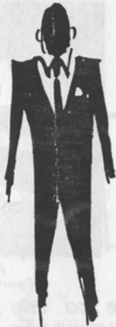
BROTHER (BACK VIEW)